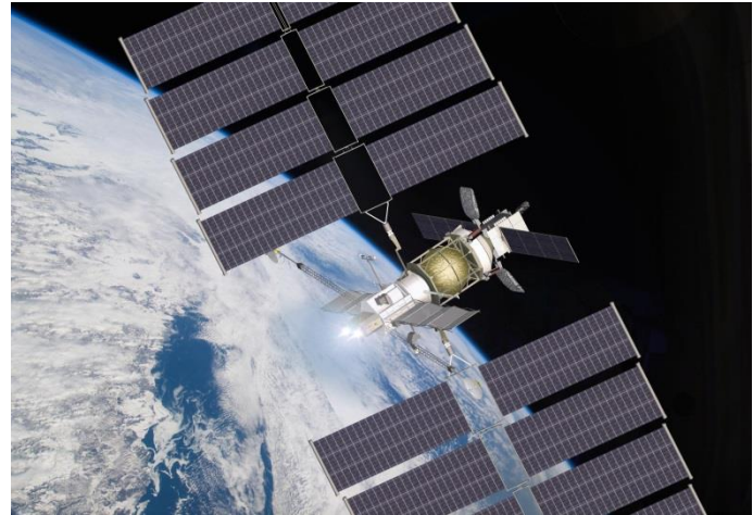
Concept of a 300 kW VASIMR®-SEP space tug with attached payload

Ad Astra Rocket Co (Ad Astra), developers of the VASIMR® electric propulsion engine, presents the advantages of its propulsion technology to deliver large (>2Mt) scientific payloads to points in deep space, such as the Jupiter system, very fast, by means of a high power (> 300 kW), solar electric propulsion (SEP) space tug.